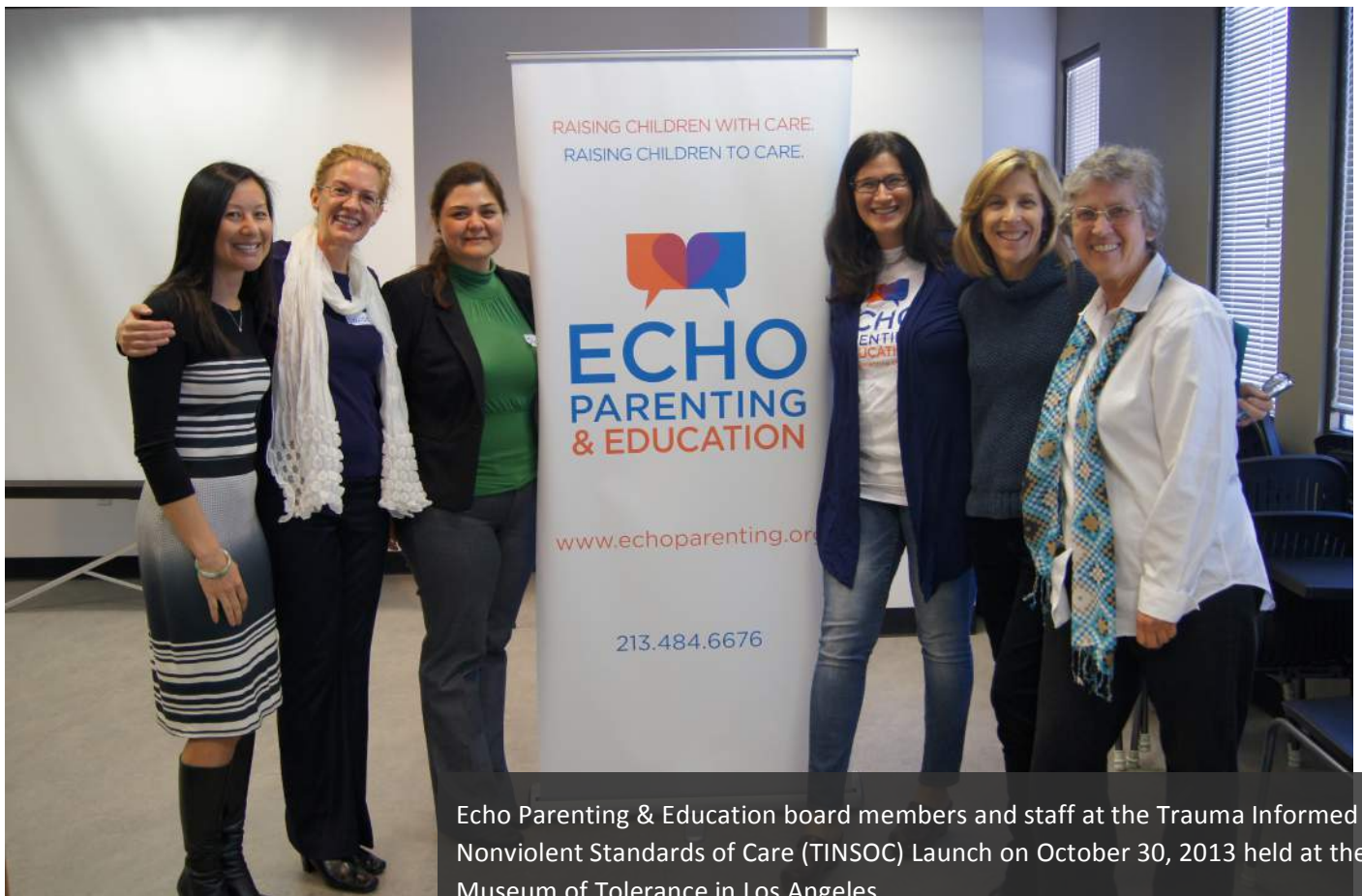
Echo Parenting & Education board members and staff at the Trauma Informed Nonviolent Standards of Care (TINSOC) Launch on October 30, 2013 held at the Museum of Tolerance in Los Angeles.

Our team has never been stronger, and we are setting our sights high.