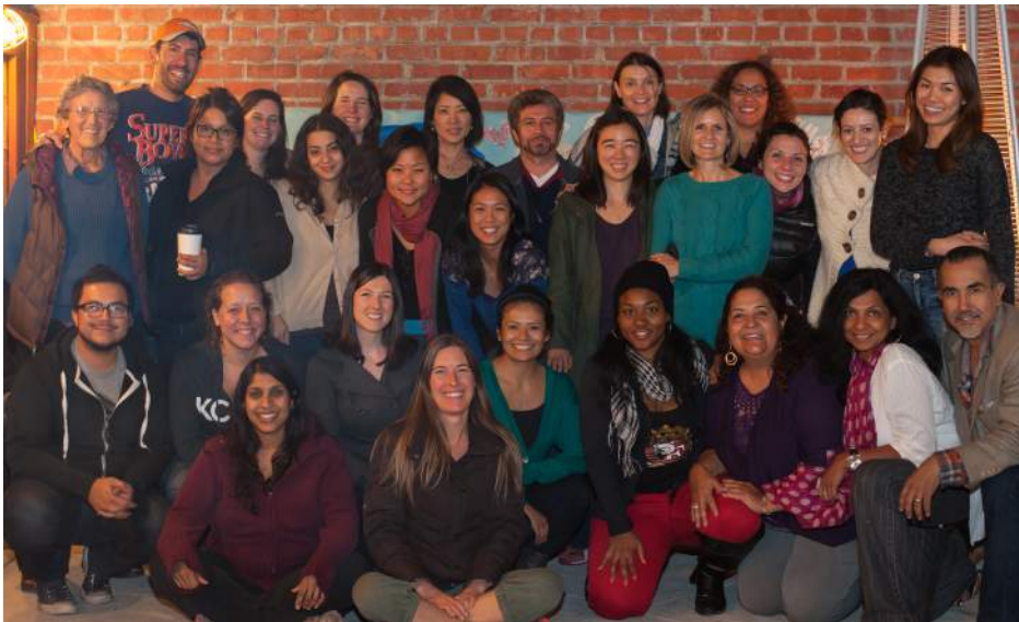
2013-14 Parent Educator Training Program Graduates